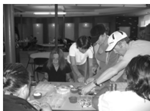
Participating in arts & crafts is a weekly enjoyment activity in the Robert Tegler Friendship Room