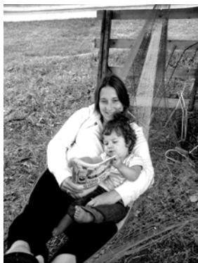
One-on-one hammock time for mom and daughter at camp

Sponsor a group of adults to attend an Aboriginal sweat lodge