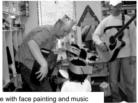
Bissell volunteers entertain childcare with face painting and music