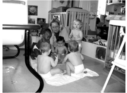
Water babies in childcare